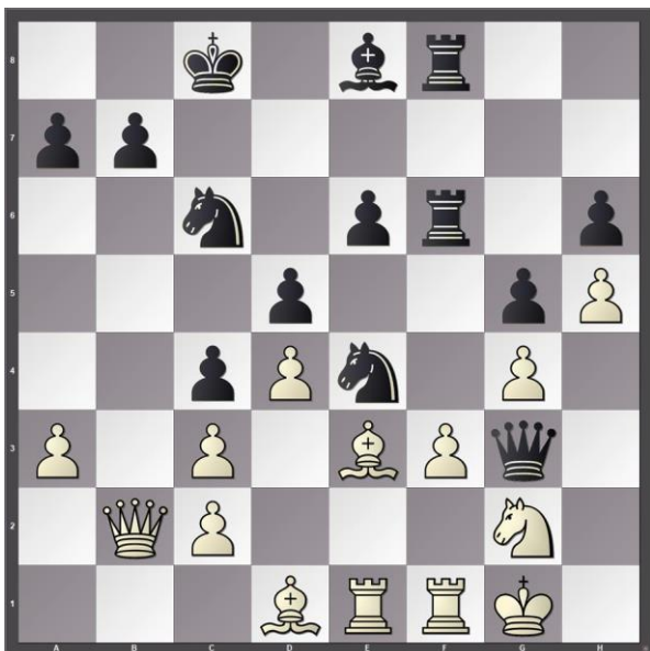
1. Black to move.