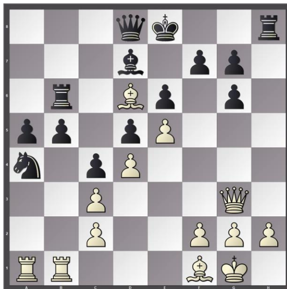
2. Black to move.